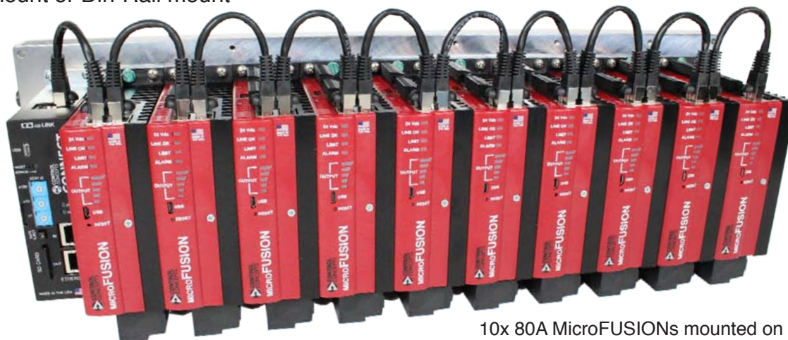
10x 80A MicroFUSIONs mounted on a liquid cooled heatsink with 10 node EtherCAT CONNECT gateway. Maximum power of 480 KW