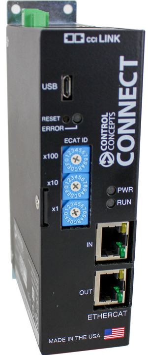
Connect Module configured with EtherCAT communications option.