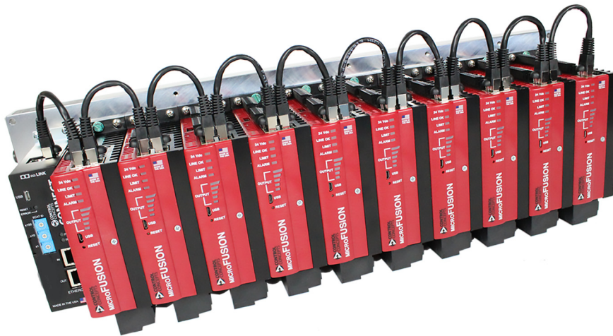
(10x) 80A microFUSION controllers mounted to a heat sink with a 10 node EtherCAT Connect Gateway. (Maximum power of 480 KW)

* Data Logger is not available for copy-exact requirements (please contact Control Concepts for more information).