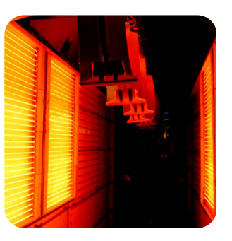
Gas Discharge Ultra Violet